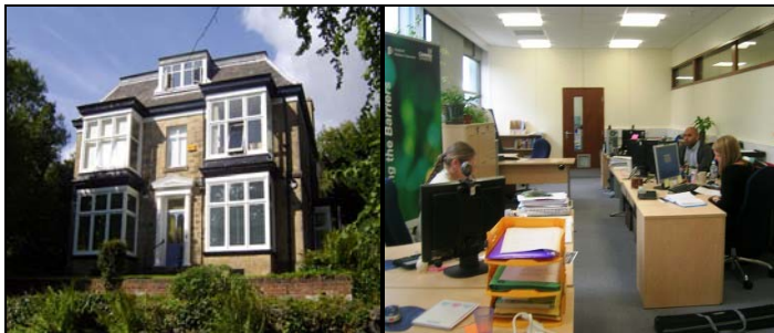
Pictured above: Sheffield Hallam (left) and Coventry new CIPeL locations.

The CIPeL has been extremely busy over the last 8 months, with both partners (Coventry and Sheffield Hallam Universities) allocating capital monies to refurbish new office space, meeting areas and resource/training rooms.